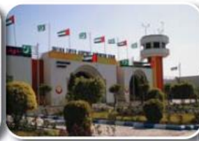
RAHIM YAR KHAN